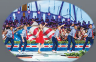
Multimedia Celebration West Potomac Park

A program with live music, video montages and multimedia elements!