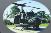
Camp Legacy JFK Hockey Fields/West Potomac Park

Interactive experiences, static displays, exhibits, Veteran Services Hub and more!