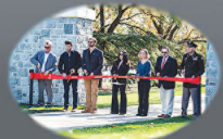
Opening Ceremony JFK Hockey Fields

A formal Ribbon-Cutting Ceremony opening Camp Legacy!