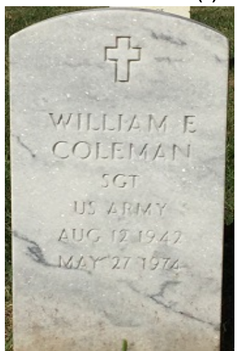
This headstone is 42 inches long, 13 inches wide and 4 inches thick. Weight is approximately 230 pounds. Variations may occur in stone color, and the marble may contain light to moderate veining.

UPRIGHT HEADSTONE WHITE MARBLE (U) OR LIGHT GRAY GRANITE (V)